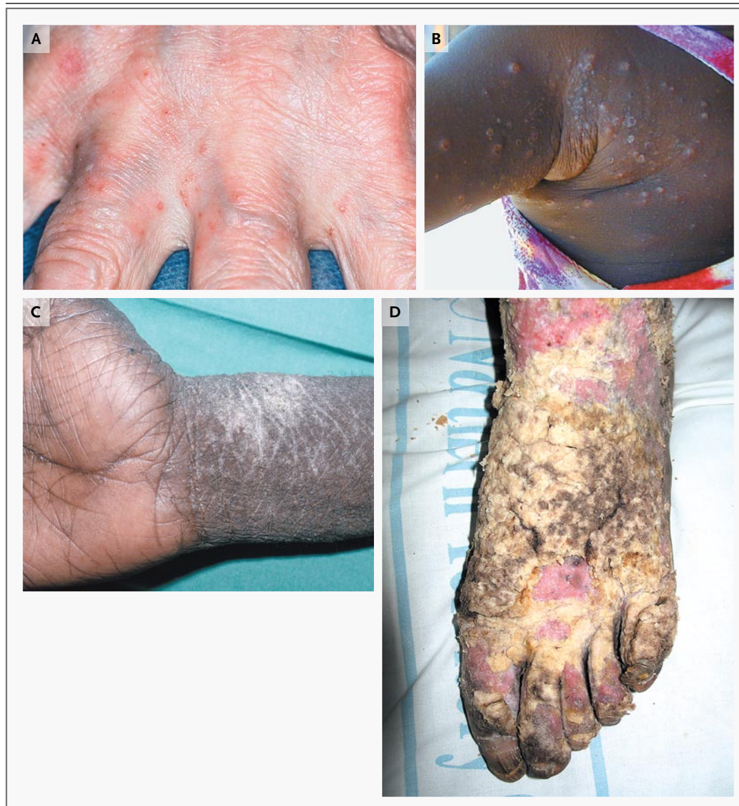
Figure 2. Manifestations of Scabies.

Interdigital lesions are a typical manifestation of classic scabies (Panel A). A pattern of excoriations in the axilla is characteristic of scabies with secondary bacterial infection (Panel B). Crusted scabies can be manifested as excoriated, lichenified skin on the wrists and hands (Panel C). A case of severe crusted scabies can result in sloughing of layers of thick, hyperkeratotic skin, with fissures that can result in secondary bacterial infection and the potential for bacteremia and systemic sepsis (Panel D). Panel A reprinted from Chosidow. 2